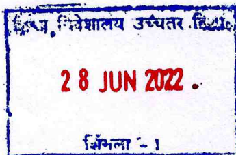
Director of Higher Education Himachal Pradesh